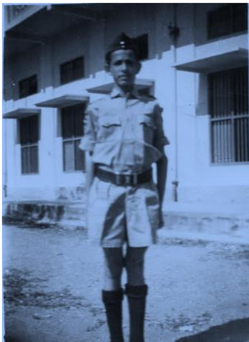
The author as an NCC Cadet at Campion